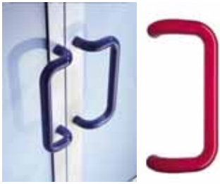
Cranked Pull Handle Nylon