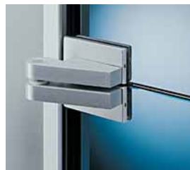
Patch Fittings - offers offset hinges that allow single action doors to be fitted with or without a rebated frame.

Glass thickness: 8, 10 or 12mm Rebated frames with 24mm frame stop depth - Max door weight: 75kg, Max door width: 1000mm Without rebate - Max door weight 80kg, Max door width: 1100mm