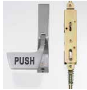
7085P Panic Exit Device Aluminium push paddle handle. Concealed plated steel locking rods. Emergency exit for hollow stile doors.