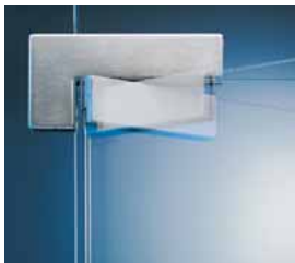
Universal Patch Fittings Broad spectrum of types and variants Can be supplied with various fixed parts including with corner fittings or fin fittings at different angles, With double or single action doors in single-leaf or double-leaf designs.