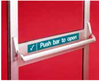
7085 Panic Exit Device Concealed vertical rod for aluminium doors with steel locking rods adjustable in length, for a wide range of door stiles.