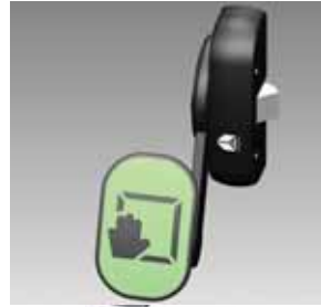
PH352 Single Point Push Pad Exit Latch Reversible