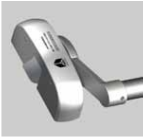
PH350 SERIES Single Point Panic Latch Reversible