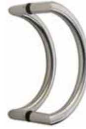
Semi-Circular Pull Handle Stainless Steel