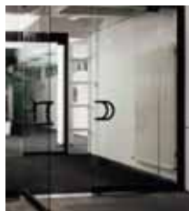
Nylon Solid Semi-Circular Cranked Pull Handle